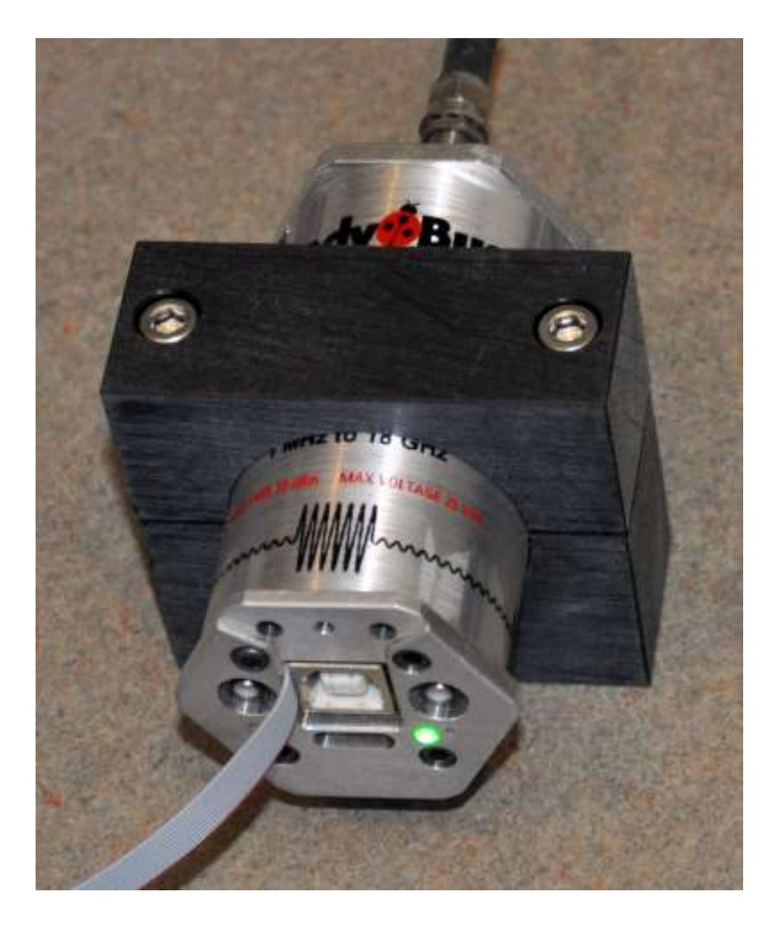
Figure 4. LB5918A with SPI Connection in Action.

Newly released, highly accurate RF and microwave power sensors are available with SPI and I2C in addition to their USB interfaces. These new sensors are fully characterized and calibrated, plus they are first tier NIST traceable. A LadyBug Technologies LB5918A Power Sensors and its SPI/I2C interface cable and connector is shown secured in its ATE mounting bracket in Figure 4.