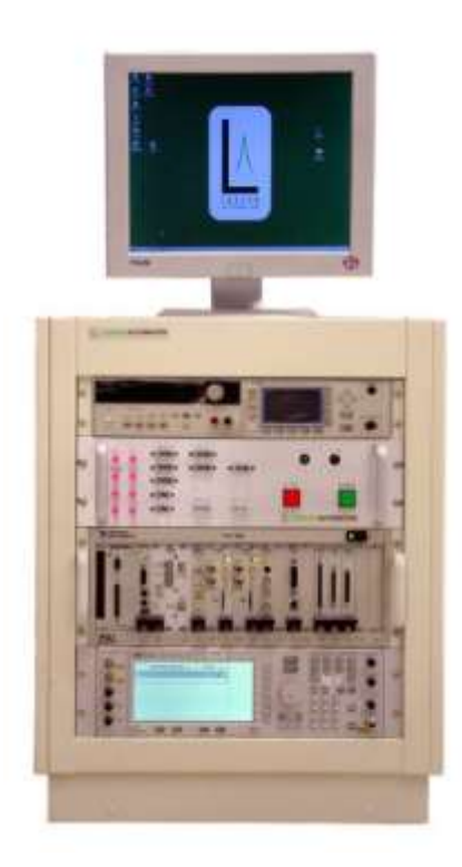
Figure 1. Modern 802.11 Communications Test Set.

These important systems provide a complete test solution for the user and have become very important in applications wherein devices with new signal types, high power components, and other advanced technologies are constantly introduced. Usually called ATE (Automated Test Equipment) these test sets help designers and manufacturers of various devices and equipment get quick, complete analysis of their targets without performing individual tests. Using these test sets also frees up more of the user's valuable time to develop, test and manufacture. A typical modern ATE system is shown in Figure 1.