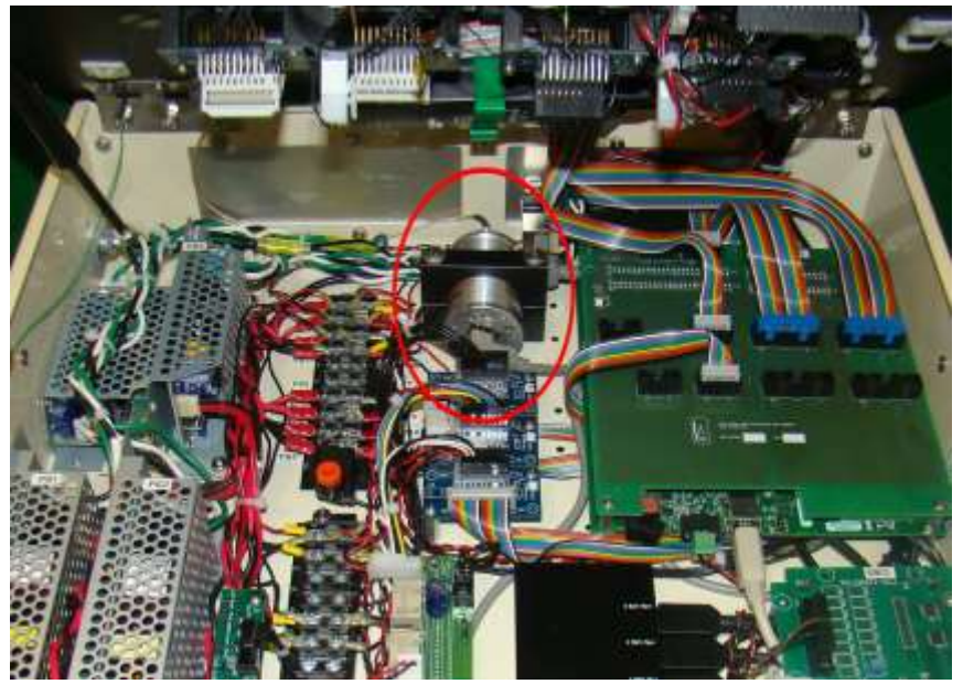
Figure 3. Test set for wearable devices.

The new systems both cost less and do more than their predecessors. These factors have resulted in an increase in the number of test sets that are in service. As an example, manufacturers of wearables and new medical devices will introduce hundreds of new products and spawn several new companies this year alone. This new industry must have reliable test systems that are capable of verifying their devices in development, and then scaling up for use in manufacturing to test the same products.