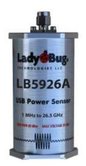
Figure 2. LadyBug LB5926A Power Sensor with SPI & I2C.

as the LadyBug LB5926A sensor shown in Figure 2. The components are connected and controlled by USB cabling and represent a significant advance in testing.